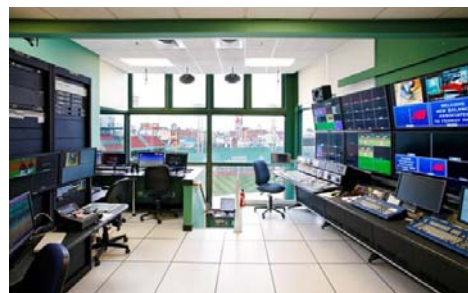
The scoreboard control room and media area were renovated

Boston, MA - Walsh Brothers, Incorporated, a Boston-based construction management company, has successfully completed the final phase of a capital improvement plan at the Boston Red Sox's