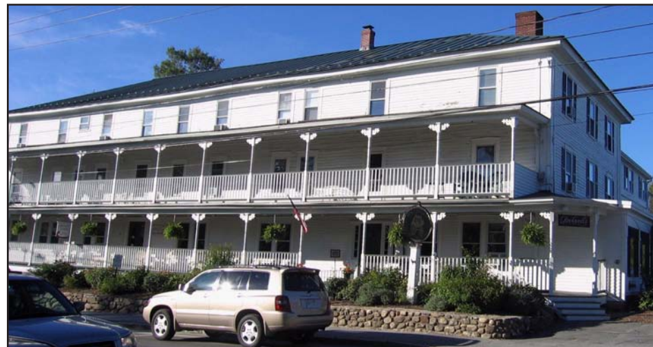
The historic New London Inn has been upgraded to improve energy efficiency and comfort.

New London, NH - North Branch Construction of Concord has completed renovations of the New London Inn. This historic building, built in 1792, has received several upgrades throughout a three-month job that include repairs to the heating control system, interior renovations, and new insulation and siding. These upgrades have improved the inn's energy efficiency while maintaining its historic charm and iconic presence in New London.